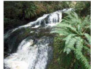
Ludlow Creek and Falls can be accessed from behind the Port Ludlow RV Park. There's a half-mile trail to enjoy.