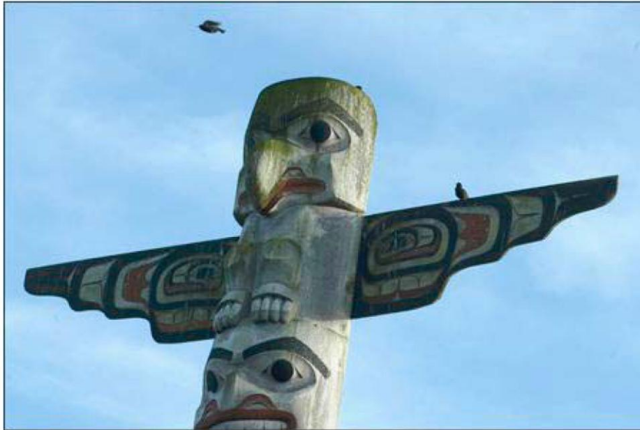
David Boxley's totem pole stands on Burner Point behind The Inn At Port Ludlow.