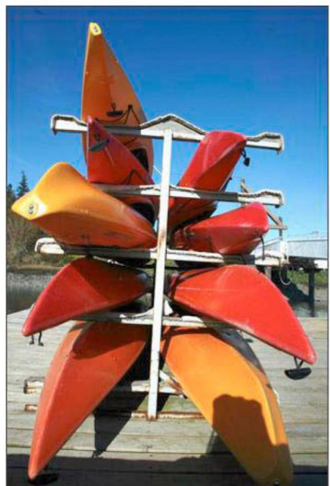
The Port Ludlow Marina, part of the Resort At Port Ludlow, rents kayaks and bikes. For $10 an hour, you can rent a kayak and paddle around the bay. It's an ideal place for novice kayakers or young paddlers.