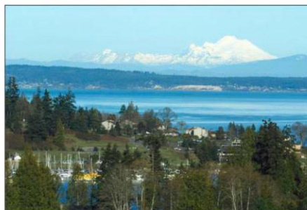
From the third hole on Trail Nine, one of three nine-hole courses at Port Ludlow Golf Club, players get views of Mount Baker and the resort marina.

Alas, I am not a golfer, so I checked out its stunning setting — with sloping greens nestled among trees, overlooking the water — then moved on.